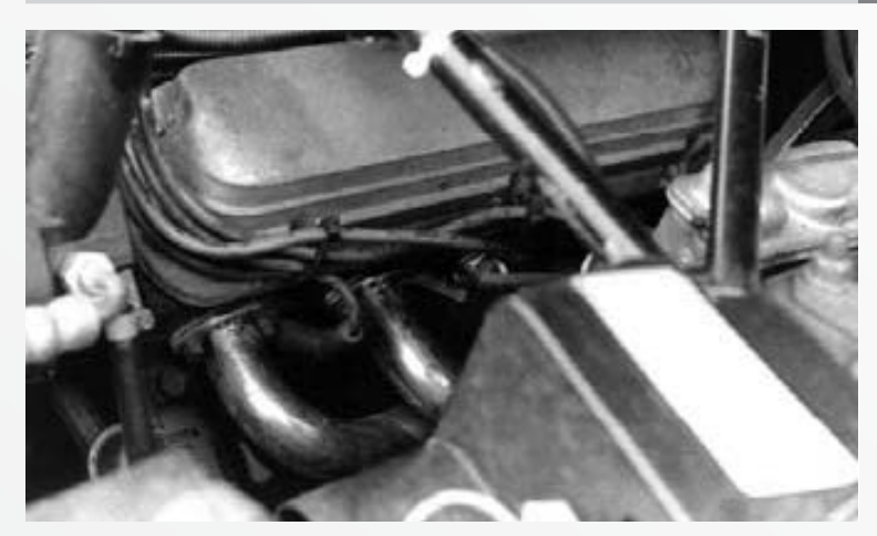
Before re-installing, the dip stick will require clearance.